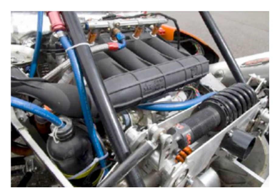
Figure 1: Air intake manifold made using SLS at TNO, the Netherlands [11]

In spite of all these developments, the problem however does remain, that RM is not an established process. Rather, it is a group of technologies applied by the engineer, who is familiar with not only the latest processes, but also with the limitations and process constraints. Therefore, RM needs to be formally listed in specification sheets or recorded during the development process, so that it can be fully integrated into the manufacturing chain. If such an implementation is made, the automotive industry can make use of the previously unknown design freedom offered by RM.